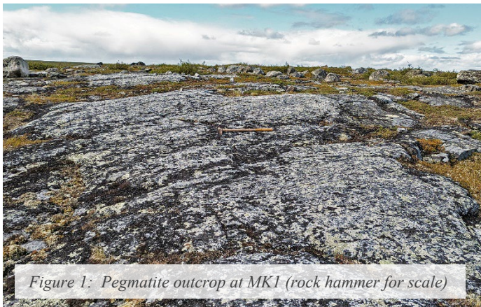
Figure 1: Pegmatite outcrop at MK1 (rock hammer for scale)

North Arrow Minerals Inc. (TSXV-NAR) (“ North Arrow ”) is pleased to report new lithium assays from the company’s 100% owned MacKay Lake Property, Northwest Territories, and that additional exploration work is underway.