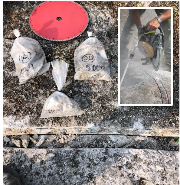
Figure 1: Channel samples taken from the Moose 1 pegmatite. Inset: Rock saw at work cutting a channel for sampling at Moose 1 pegmatite. DeStaffany Project, June 2023.

The majority of channel samples were collected from the Moose 1 pegmatite, which had seen limited historical evaluation. Moose 1 has been mapped in outcrop over a north-south strike length of approximately 350m. Fourteen channels (54 samples), ranging from 3m to 5m in length, were cut over an approximate 260m strike extent of the pegmatite. Assays confirm that spodumene mineralization is consistent over the southern two thirds of the